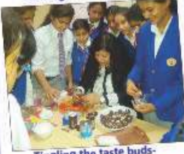
Tingling the taste buds- Culinary Club