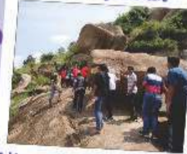
Taking a break- trekking at Bengaluru