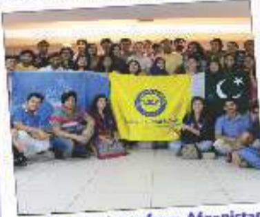
Visiting students from Afghanistan and Pakistan- a Peace Club initiative