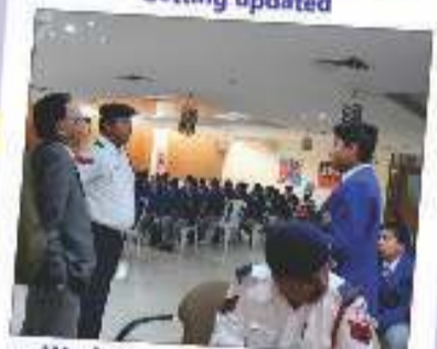
Workshop on 'Traffic Rules' being conducted