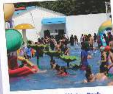
Day out at a Water Park