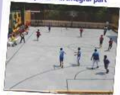
Ample opportunities for fitness