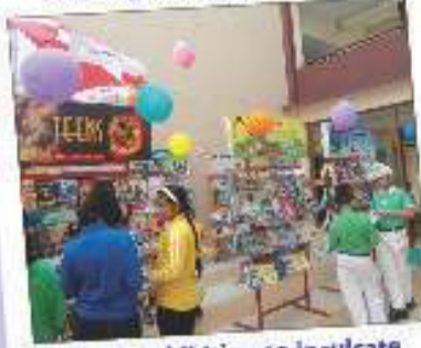
Book exhibition to inculcate reading habits