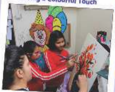
Creating magic with colour- Art class in progress