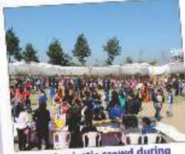
Enthusiastic crowd during the school Fete