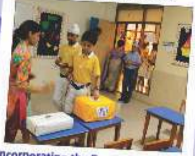
Incorporating the Democratic Process