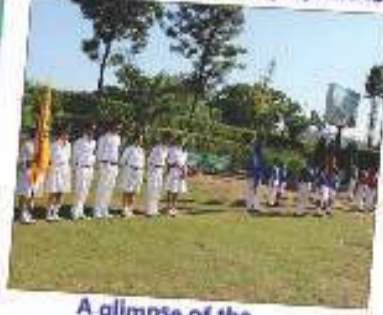
A glimpse of the Investiture Ceremony