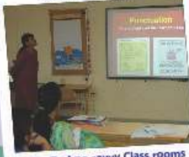
Our Techno savvy Class rooms