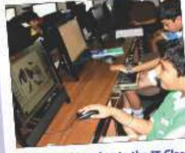
Futuristic Learning in the IT Class