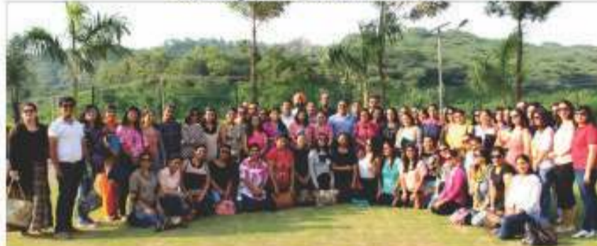
Teachers Enjoying a Day out on Teacher's Day